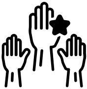
Accountability and Transparency