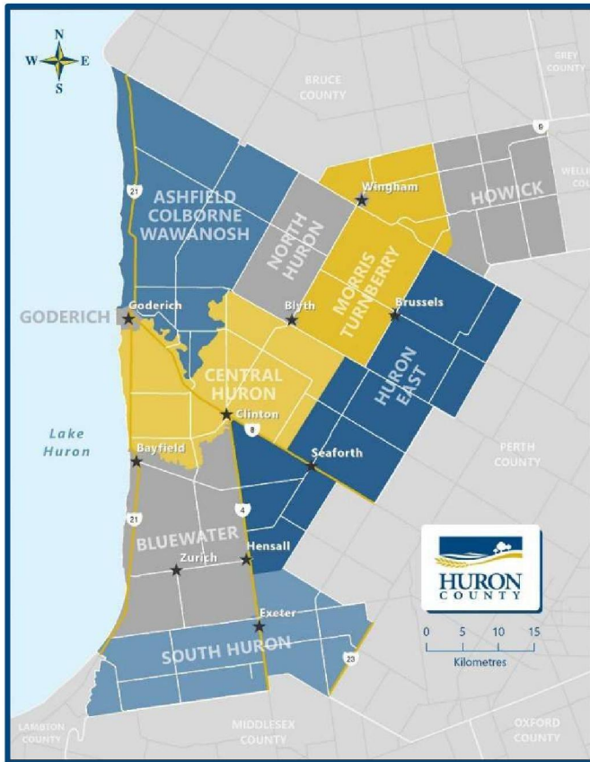
Figure 1: Huron County Map

The Huron County Accessibility Advisory Committee (HCAAC) serves as the Accessibility Advisory Committee (AAC) for Huron County, mandated by the Accessibility for Ontarians with Disabilities Act (AODA), 2005, S.O. 2005, c. 11 . HCAAC is dedicated to advising Huron County Council on the implementation of accessibility standards across the County's nine partner municipalities (see Appendix for HCAAC's objectives and priorities). Comprising primarily of individuals with disabilities, the committee plays a vital role in creating an accessible community by providing input on accessibility plans, site developments, and public spaces. Through education, consultation, and advocacy, the HCAAC ensures that Huron County remains inclusive and accessible for everyone.