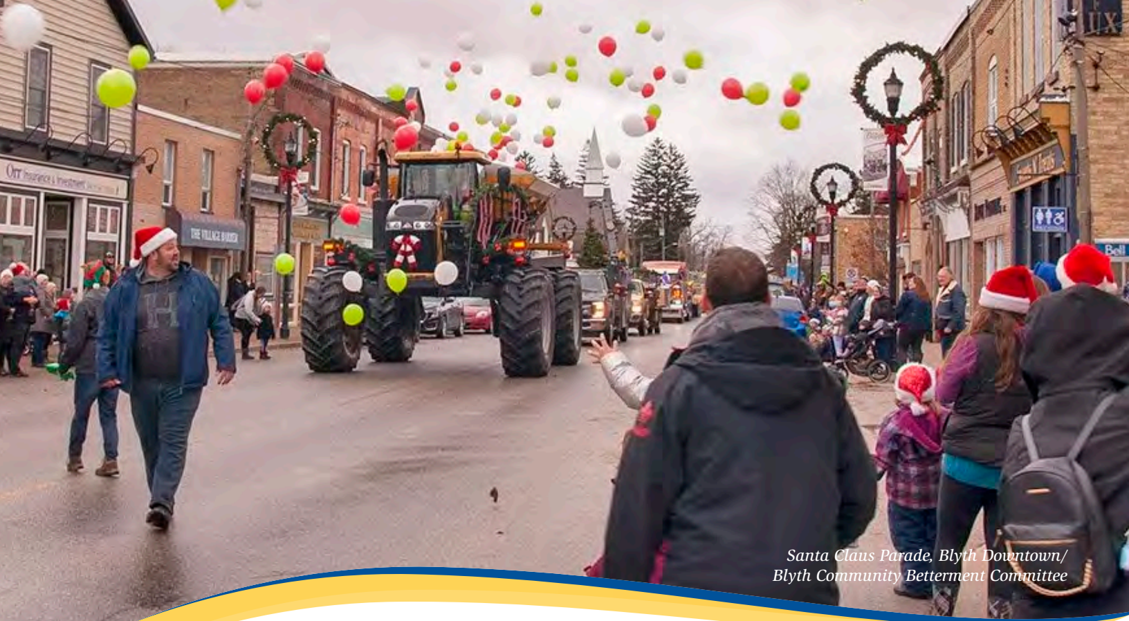
Santa Claus Parade, Blyth Downtown/ Blyth Community Betterment Committee