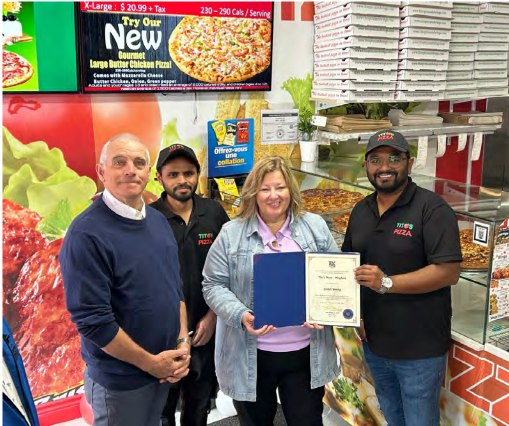
The Township of North Huron welcomes a new business in Wingham.