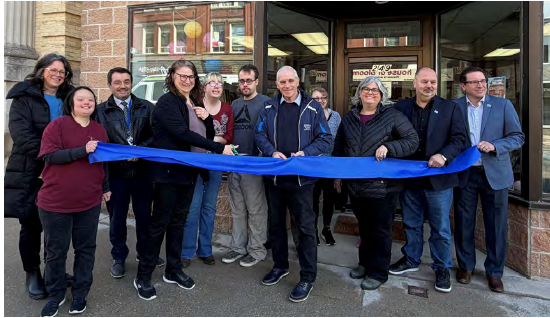
The Township celebrates a ribbon-cutting ceremony for a new business in Wingham.

We are looking forward to having you as part of our thriving business community. Whether you are just starting, expanding or investing in something new, we are here to help you succeed. Your main point of contact is our Economic Development Officer- your dedicated resource for navigating opportunities, connections and local insights.