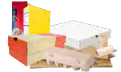
Cardboard and boxboard