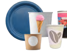
Paper laminate packaging